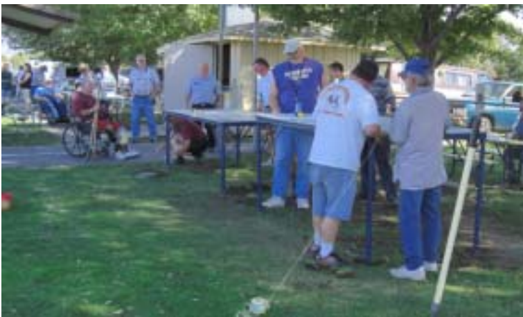
Club Members Swing Into Action!

Yes, there are rumors abound that club members only card about flying! Here is documented proof that club members are willing to idle there passion for waggling sticks. Here is a photo from a spy satellite showing members pitching in to install 2 new table at the field.